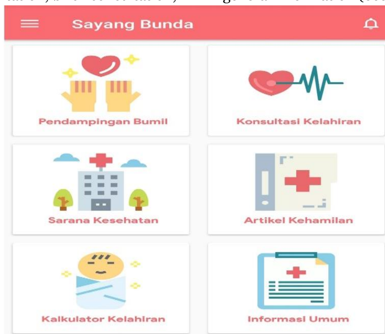
Figure 2. Menus of “SAYANG BUNDA” Application

proximate healthcare facilities, pregnancy article, calculator of estimated due date, and general information (See Figure 2).